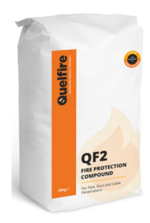
QF2 Fire Protection Compound