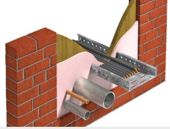
QF2 Fire Protection Compound used in conjunction with MW Mineral Wool Slab